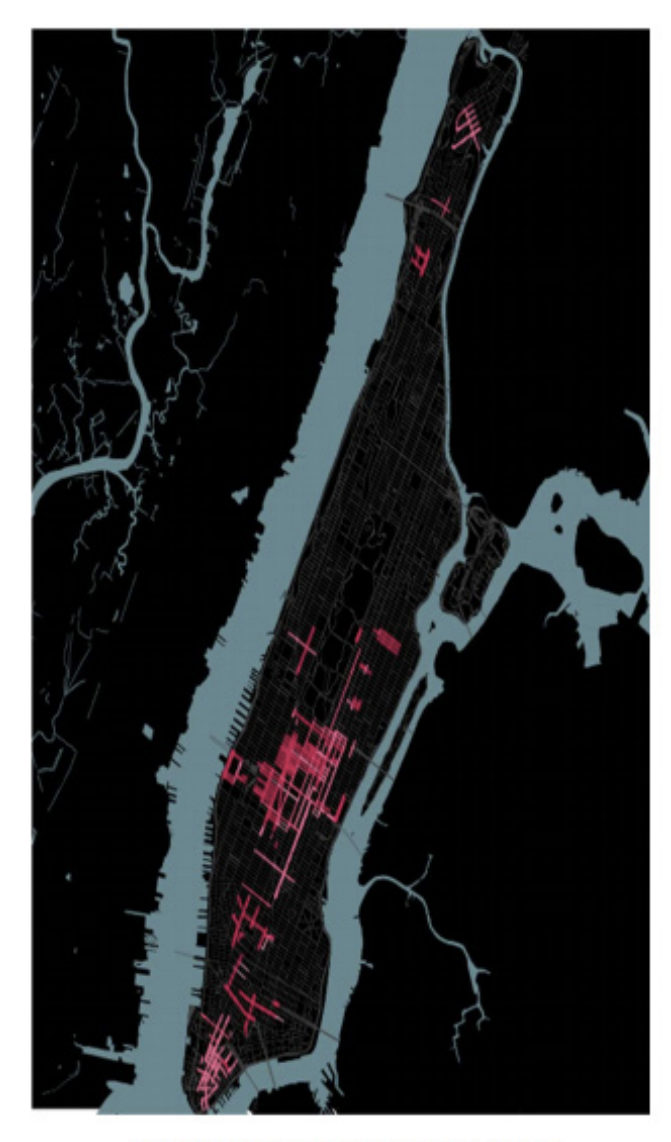
Figure 3 Time-Based Vending Restrictions

Figure 3 shows time-based street restrictions in Manhattan with the darker color indicating the strictest regulations and pale pink indicating least strict regulations. The plain grey streets have no special restrictions on them (Qadi 30).